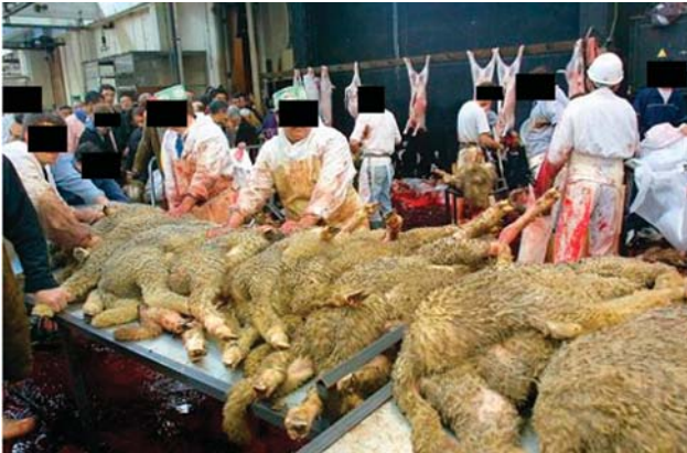
Figure 2. The Aid El Khebir sheep sacrifice in the abandoned Marseilles slaughterhouse.

slaughterhouse were the only identified risk factors. We showed here that homeless persons were likely exposed to C. burnetii in shelter A during the month that followed the Aid El Khebir in 1999, with the wind playing a critical role in this outbreak. Some controversy surrounds this feast in France because of the way sheep are ritually sacrificed. Several hundred sheep are maintained for a few days inside and outside the slaughterhouse before having their throats slit and being bled outside. They are then displayed to buyers, as shown in Figure 2. That sheep are maintained under conditions of poor hygiene, without veterinary counsel, and that the bleeding and sale takes place outside may explain how C. burnetii -infected particles could have contaminated soil, wool, or loose straw, and particles could have blown downwind. Veterinary control of sheep flocks would help avoid such contamination.