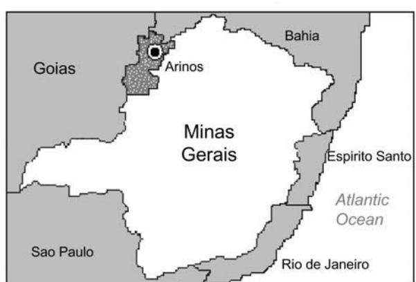
Figure 1. Map of the Arinos region, where the strain BeAN 626998 was isolated from a sylvatic monkey of the genus Callithrix .