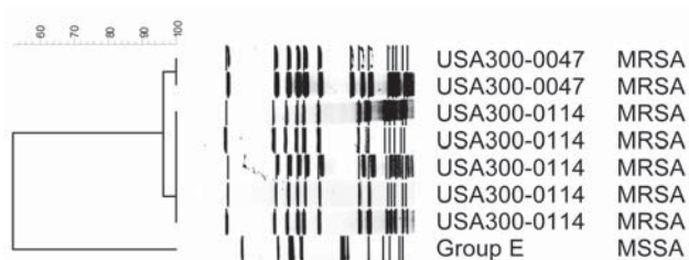
Figure 2. Dendrogram of pulsed-field types for methicillin-resistant Staphylococcus aureus (MRSA) and methicillin-susceptible S. aureus (MSSA) isolated from methamphetamine users.

veyed methamphetamine users was evenly divided between the sexes. We also did not find many MRSA infections in nonwhite patients. This finding contrasts with previous reports of higher incidence of MRSA SSTIs in African Americans in urban centers compared to other races (4) and likely reflects the predominantly white racial distribution (98.9%) in these 3 rural southeastern US counties (13).