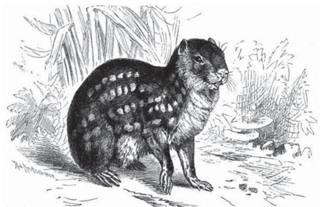
Figure 4. The paca, Cuniculus paca , the natural intermediate host for Echinococcus vogeli and rarely E. oligarthrus . Drawing by Robert Kretschmer (1818–1872).

In just a few years, a second indigenous South American echinococcal species had been discovered, and the life cycle of the parasite, involving the bush dog and the paca, had been described. In a survey of Colombian mammals, 73 (22.5%) of 325 pacas harbored metacestodes of E. vogeli , but only 3 (0.9%) of pacas harbored E. oligarthrus . Twenty (6.2%) more pacas were shown to be infected with polycystic larvae, but the species involved could not be determined. In addition to the bush dog, a domestic dog belonging to a hunter was found to be naturally infected with adult E. vogeli (38). Researchers then assumed that domestic dogs might play a role in the transmission of parasite eggs to humans.