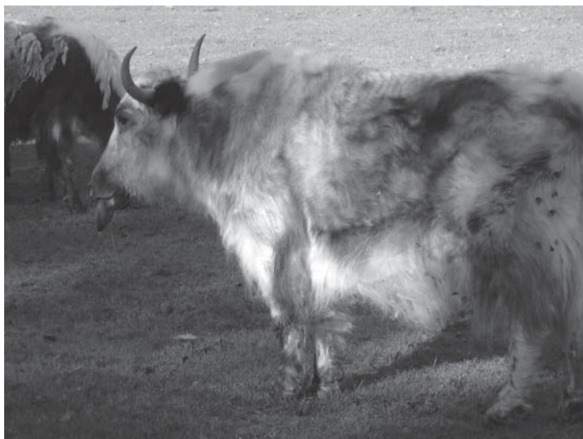
Figure. A captive yak infected with bluetongue virus. Tongue is swollen, cyanotic, and protruding from the mouth.

To the Editor: In August 2006, several northern European countries including Belgium reported cases of bluetongue (BT) (1). This noncontagious, arthropod-borne animal disease is caused by Bluetongue virus (BTV), genus Orbivirus , family Reoviridae . The genome of BTV consists of 10 segments of double-stranded RNA; 24 serotypes have been reported (2). Serotype 8 (BTV-8) was implicated in the emergence in Belgium (3). All ruminant species are thought to be susceptible to BT (2). We report laboratory-confirmed clinical cases of BT in yaks ( Bos grunniens grunniens ).