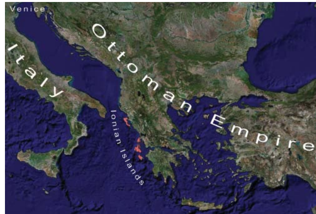
Figure 1. Map of the wider geographic area of reference.

The 4 large islands in the Ionian Sea (Figures 1, 2) are a useful area for research because they had been under Venetian rule and were located just off the western coast of mainland Greece. This location made them a gateway to and from the Ottoman Empire and a frontier of Venice to the East. However, despite their proximity to mainland Greece, political and institutional differences were substantial between these islands and the neighboring Greek coast that was under Ottoman rule. Research regarding plague in this area has been limited. Moreover, comparisons of Ve-