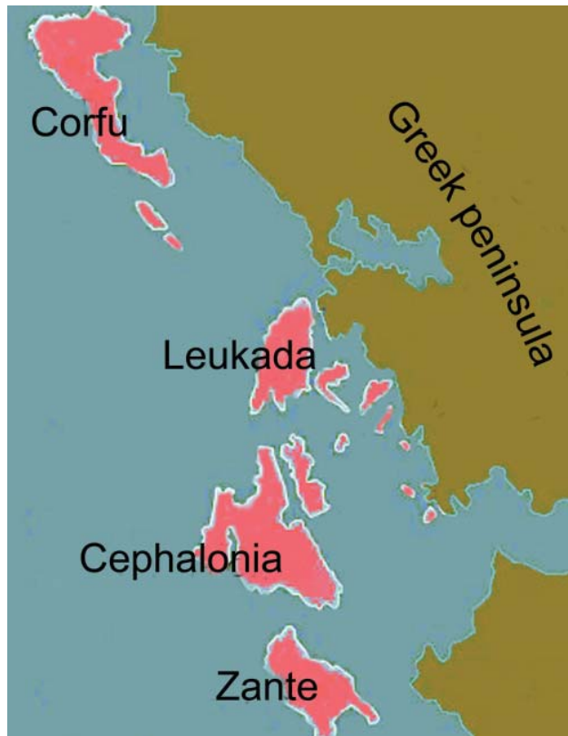
Figure 2. The 4 large Ionian Islands, which were under Venetian rule, and the Greek peninsula, which was under Ottoman rule, during the period studied (17th and 18th centuries).

historically. This article examines the subject from medical and epidemiologic points of view.