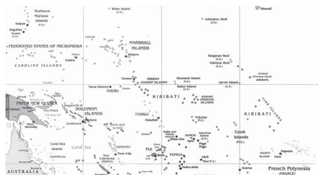
Figure 1. Island nation states of the Pacific region.