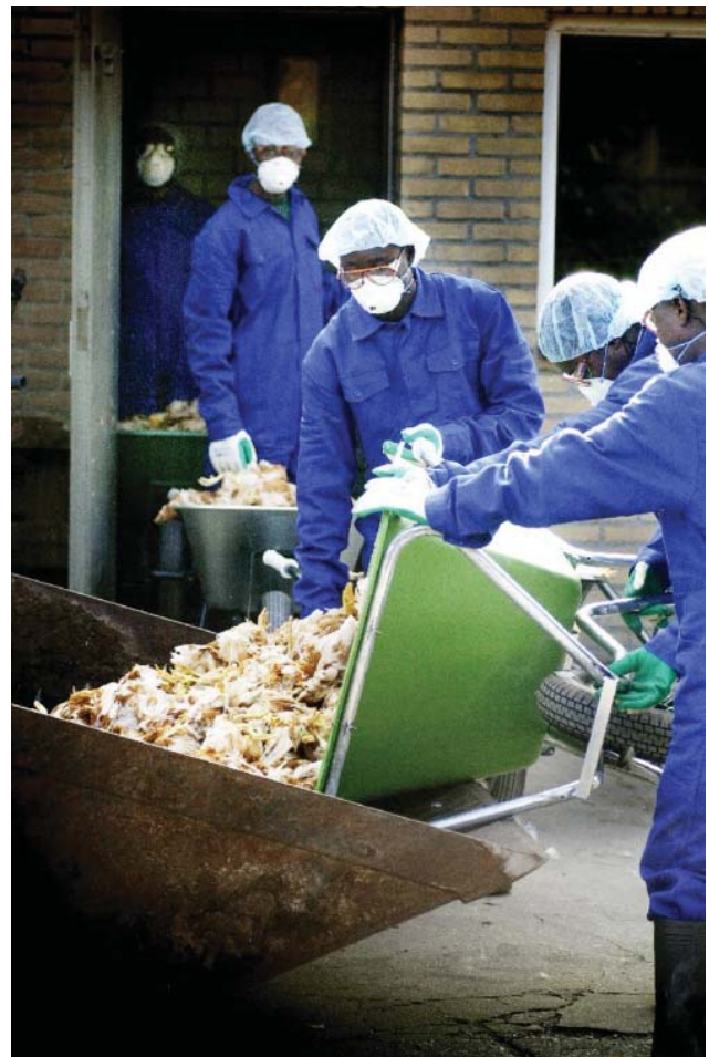
Figure 1. Poultry worker wearing respirator and safety glasses, the Netherlands, 2003.

The probability of becoming infected during a visit was calculated from the number of visits each person had made and whether each person was infected (according to the case definitions). The analysis comprised only visits to farms with infected poultry. During each visit, a person could either escape infection or become infected. The probability of each sequence of events could be added, from which the probability of infection per visit could be estimated by maximum likelihood (online Technical Appendix, www.cdc.gov/eid/ )