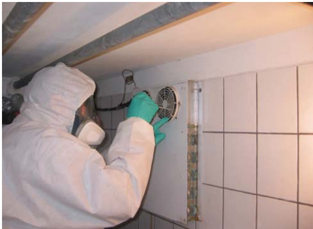
Figure 1. Sampling at the game chamber, Hesse, Germany, December 2005.

larenensis -specific DNA in hares showing a low signal in the screening PCR, we performed amplification of a 16S rRNA gene target followed by sequencing of the fragment.