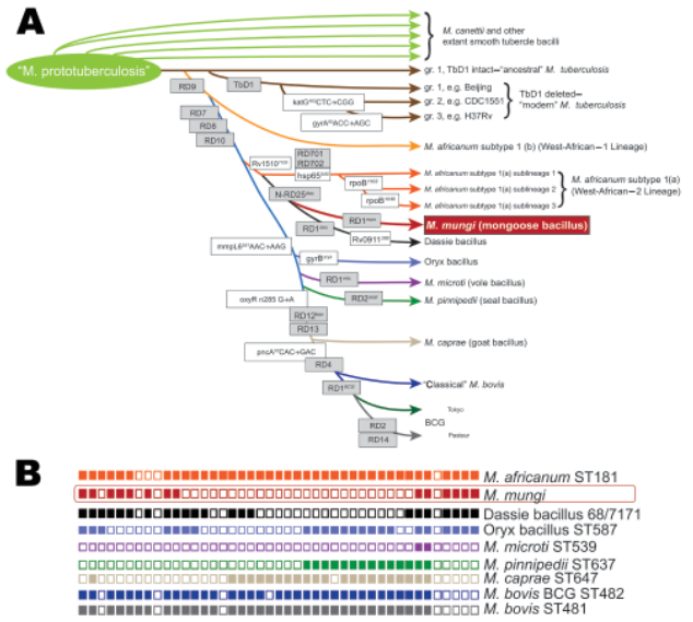
Figure 2. A) Schematic of the phylogenetic relationships among Mycobacterium tuberculosis complex species, including newly discovered M. mungi , based on the presence or absence of regions of difference (gray boxes) as well as specific single-nucleotide polymorphisms (white boxes), modified from (7). B) Spoligotype of M. mungi compared with representative spoligotypes from other M. tuberculosis complex species (8–10).

We then used spoligotyping analysis (12) to further evaluate mongoose samples and identified a unique spoli-