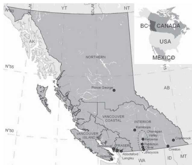
Figure 1. Select cities (lower case) in British Columbia, Canada, and regional health authorities (upper case). Each regional health authority undertakes West Nile Virus surveillance under the guidance and recommendations of the British Columbia Centre for Disease Control. The dashed oval encompasses the Okanagan Valley, which was the primary focal point of West Nile Virus activity in British Columbia during 2009. WA, Washington, USA; ID, Idaho, USA; MT, Montana, USA.

The British Columbia Centre for Disease Control (BC-CDC) and the BCCDC Public Health Microbiology and Reference Laboratory (PHMRL), in partnership with regional health authorities, municipalities, and regional governments, have conducted human surveillance, mosquito sampling, and dead corvid surveillance and testing since 2003. During the WNV seasons of 2003–2007, mosquito surveillance covered the southern extent of the province and extended as far north as 55°N latitude. However, in response to the prolonged absence of the virus, mosquito surveillance was reduced in 2008; mosquito traps were placed only at or below 50°N latitude (Table 1; Figure 1). An additional 16 traps were placed in the southern Okanagan Valley in 2009 as part of a research project to supplement the 91 traps operated by the province, effectively acting as targeted surveillance in this area. CDC light traps (Model 512; John W. Hock Company, Gainesville, FL, USA) baited