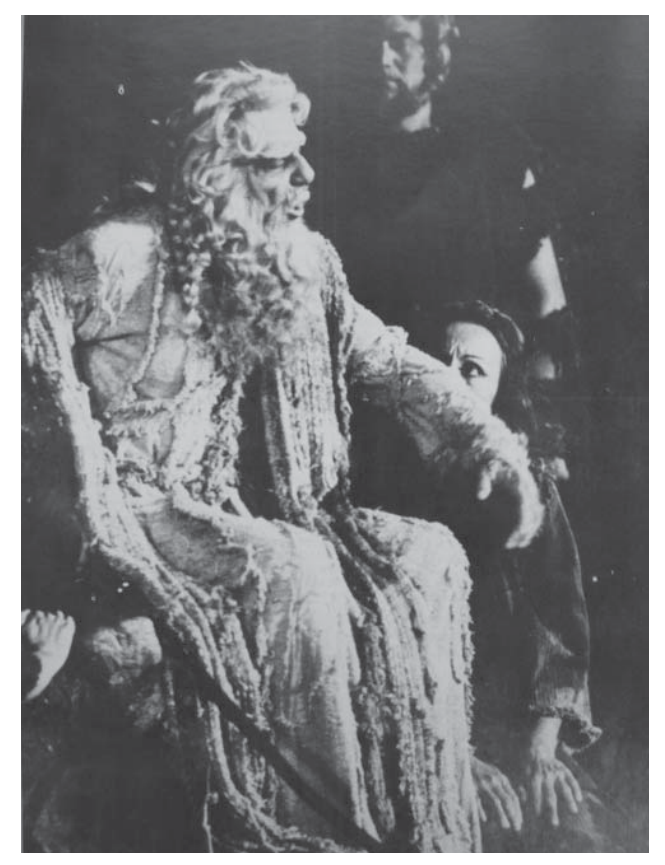
Figure 2. Scene from a National Theatre of Greece production of Oedipus Rex at the Odeon of Herodus Atticus, Athens, Greece January 1995.

Searching for the miasma, Oedipus summons the blind prophet Tiresias to reveal who is responsible for this evil (lines 300-313) (2,3). At the moment that Tiresias reveals to Oedipus that the king himself is the cause of the plague (lines 350-353), the epidemic becomes a secondary issue, and, as a result, there are only occasional references to the