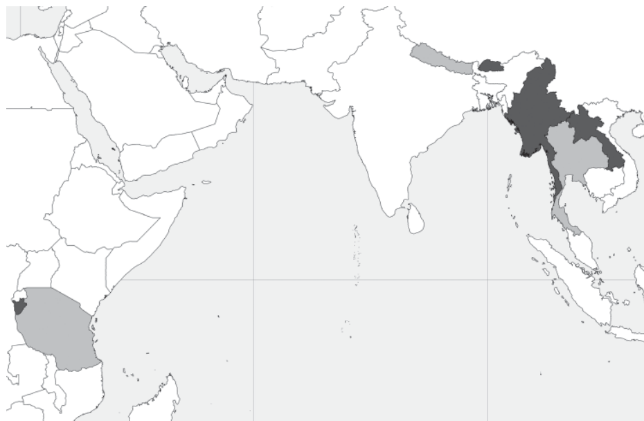
Figure 1. Geographic location and background of refugee populations sampled for antibodies against Taenia solium cysticerci by using the classic enzyme-linked immunoelectrotransfer blot for lentil-lectin purified glycoprotein. Countries of origin are shaded dark grey (Burundi, Bhutan, Burma [Myanmar], Laos). Host countries are shaded light grey (Tanzania, Nepal, Thailand). Burundi: \approx 14,000 Burundian refugees who lived in camps in Tanzania since 1972 were resettled during 2006–2008. Resettled refugees were primarily ethnic Hutu. Bhutan: ethnic Lhotshampa Bhutanese refugees arrived in Nepal \approx 1990 . Resettlement began in 2008 and is ongoing, with \approx 40,000 resettled thus far. Burma: there has been intermittent influx of refugees into

Individual 100- \mu L aliquots of each sample were separated at the CDC Central Repository, stored in microtubes, and shipped on dry ice to the CNS Parasitic Diseases Research Unit, Universidad Peruana Cayetano Heredia (Lima, Peru), for processing. Serum samples were analyzed by EITB for the presence of antibodies against T. solium cysts (EITB LLGP) as described (17). The EITB LLGP uses a semipurified fraction of homogenized T. solium cysts containing 7 T. solium glycoprotein antigens named after the Kda molecular weights of the corresponding reactive bands (GP50, GP42, GP24, GP21, GP18, GP14, GP13). Reaction to any of these 7 glycoprotein antigens is considered positive. When applied in community settings, the EITB LLGP provides an estimate of population exposure to T. solium cyst antigens. A positive EITB LLGP result alone does not definitely establish active infection