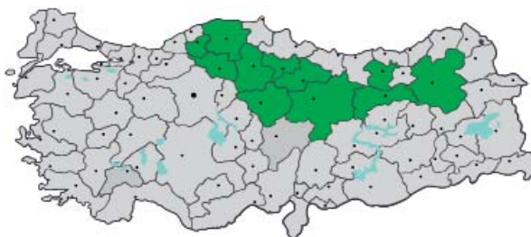
Figure 1. Provinces in Turkey where study was conducted and to which Crimean-Congo hemorrhagic fever virus is endemic (green), January–April 2009. Gray indicates other provinces and dots indicate major cities.

Of 3,557 serum samples tested, 356 (10%) were positive for IgG against CCHFV. Mean \pm SD age was 43.4 \pm 16.2 years for seronegative persons and 52 \pm 17.1 years for seropositive persons ( p < 0.001 ). Categorizing persons by