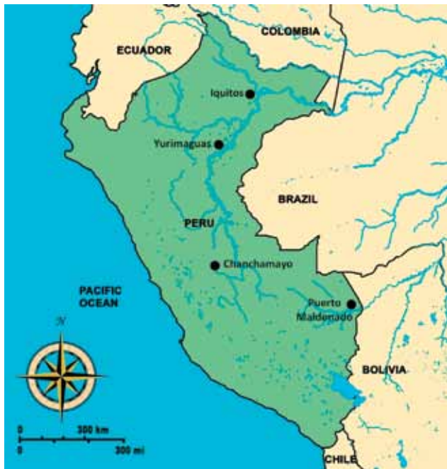
Figure 1. Map of Peru. Sites for study of Mayaro virus–infected patients are marked with a dot.