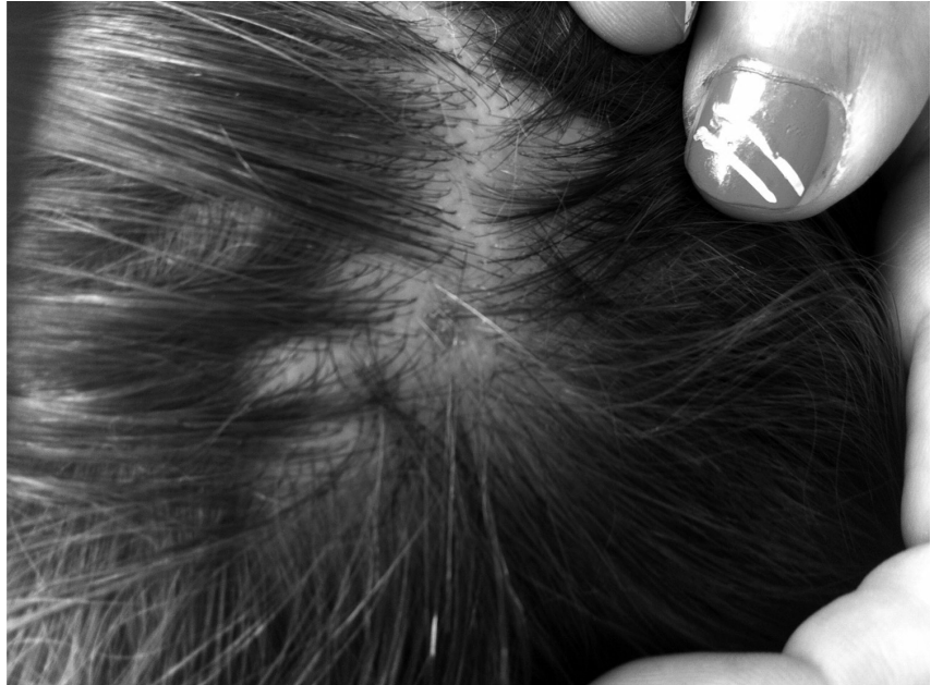
Figure. Residual alopecia 10 weeks after tick bite in 13-year-old boy with scalp eschar and neck lymphadenopathy caused by Rickettsia massiliae.

On May, 10, 2012, a 13-year-old boy was examined for headache, high fever, and right painful neck and occipital swelling. Six days earlier, a tick had been removed from the top of his scalp, after which signs and symptoms arose and gradually worsened.