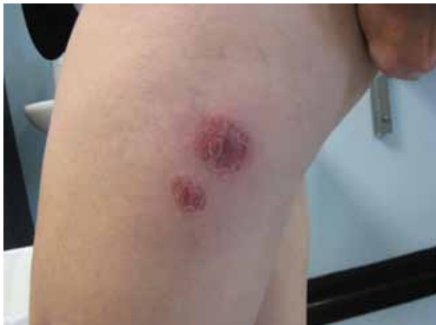
Figure 1. Mycobacterium chelonae abscesses associated with biomesotherapy, an alternative therapy practice, Adelaide, South Australia, Australia, 2008. The abscesses are at the biomesotherapy injection site.

conventional phenotypic methods (10). Molecular identification was performed on all isolates by sequencing 3 regions: 16S rDNA, 16S-23S rRNA internal transcribed spacer, and rpoB (11–13). Susceptibility testing was performed by using the disk diffusion test and Etest (bioMérieux, Baulkham Hills, NSW, Australia) (14).