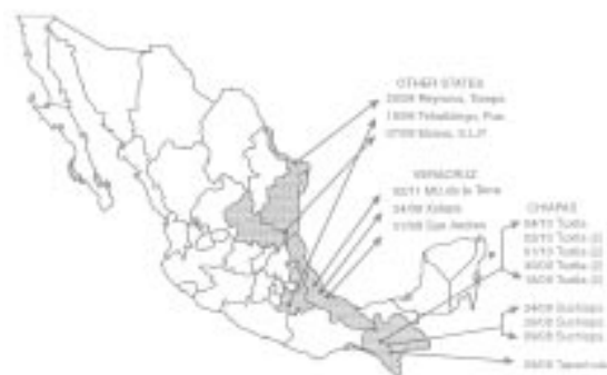
Figure 2. Geographic and temporal distribution of DEN-3 serotype in Mexico.