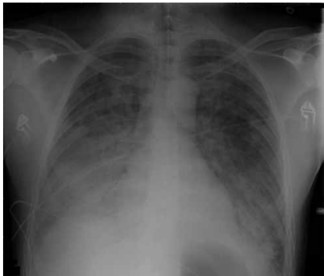
Figure. Chest radiograph of 40-year-old man with acute respiratory distress syndrome as a complication of murine typhus.

studies were prospective population-based studies of the causative agent of fever of unknown origin. The remaining 20 studies were all Rickettsia spp. specific; in 17 of these studies, patients had been recruited retrospectively from hospital databases or chart reviews.