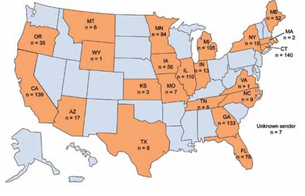
Figure 1. Distribution of Aspergillus fumigatus isolates, United States, 2011–2013. A total of 1,026 clinical isolates were received from 22 states during October 2011–October 2013.

Emerging Infectious Diseases • www.cdc.gov/eid • Vol. 20, No. 9, September 2014