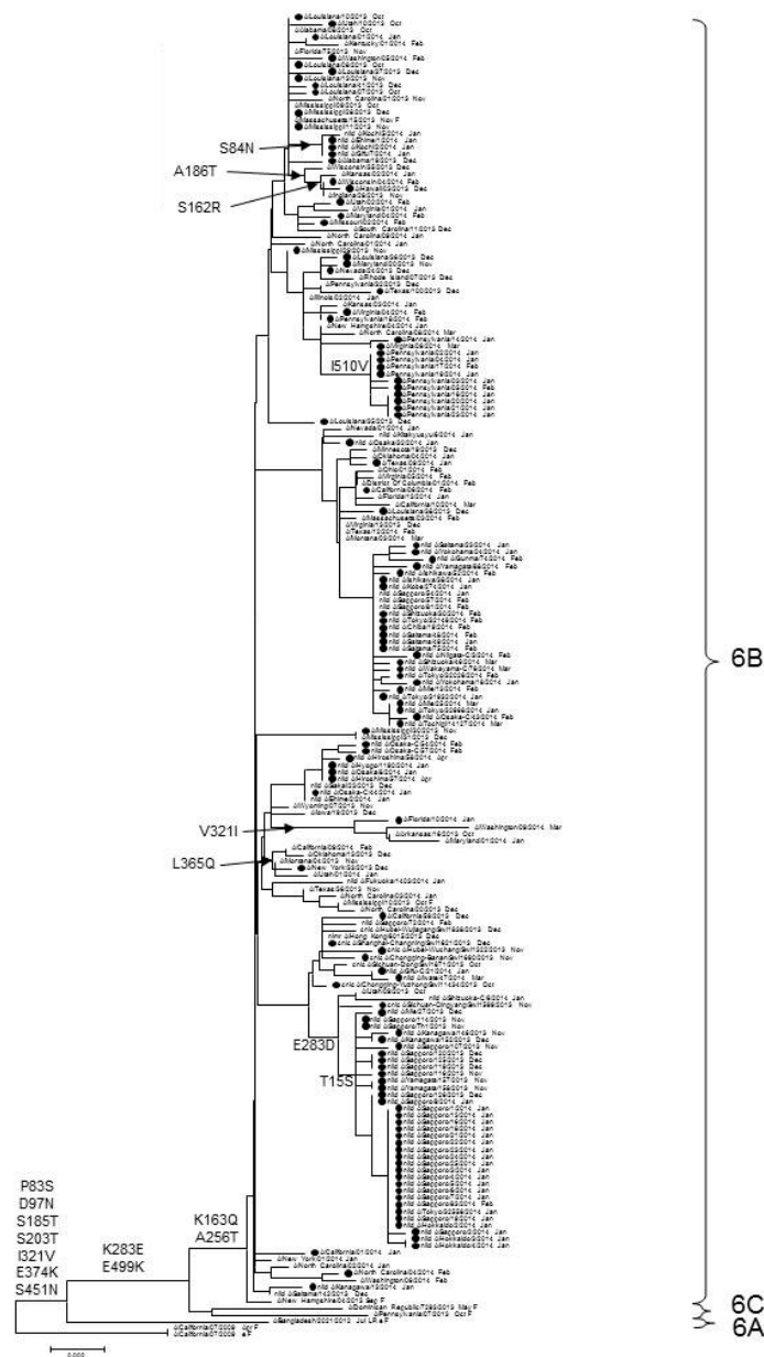
Technical Appendix Figure 1. Evolutionary relationships among influenza A (H1N1)pdm09 hemagglutinin (HA) genes, United States, 2013–14. Phylogenetic tree was generated by using the MEGA software package v5.2 ( http://www.megasoftware.net/ ) and the neighbor-joining method. Evolutionary distances were computed by using the maximum composite likelihood model. Analysis included 193 representative A(H1N1)pdm09 HA gene sequences. Scale bar indicates nucleotide substitutions per site. Solid circles indicate oseltamivir-resistant H275Y markers. A/California/07/2009 (current Northern Hemisphere vaccine strain) virus was used as a reference for ancestry (root) and numbering. F, Centers for Disease Control and Prevention reference antigen; Oct, October 2013; Nov, November 2013; Dec, December 2013; Jan, January 2014; Feb, February 2014; GLY, glycosylation.