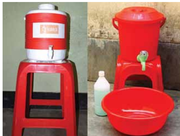
Figure 1. Cholera-Hospital-Based-Intervention-for-7-Days (CHoBI7) Intervention hardware, Dhaka, Bangladesh, June 2013–November 2014. The kit contained a water vessel with cover, chlorine tablets, hand washing station, and bottle of soapy water.

Study recruitment at Dhaka Hospital occurred Saturday–Thursday each week during the study period. Each