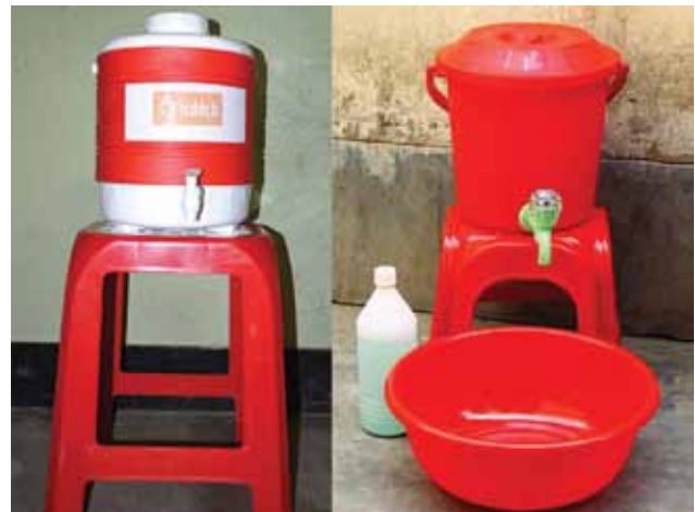
Figure 1. Cholera-Hospital-Based-Intervention-for-7-Days (CHoBI7) Intervention hardware, Dhaka, Bangladesh, June 2013–November 2014. The kit contained a water vessel with cover, chlorine tablets, hand washing station, and bottle of soapy water.

Study recruitment at Dhaka Hospital occurred Saturday–Thursday each week during the study period. Each