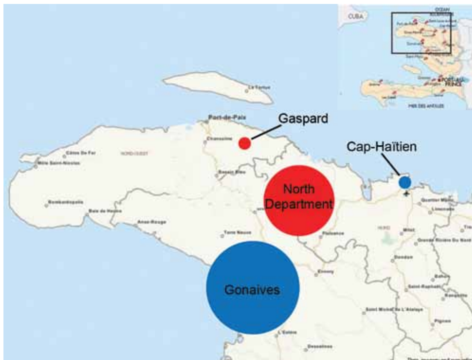
Figure 1. Study sites used to determine mortality rates during cholera epidemic, Haiti, 2010–2011: entire town of Gonaïves, urban slum in Cap-Haïtien, rural communal sections in North Department, and communal section of Gaspard. Red circles, rural sites; blue circles, urban sites. Circle size is proportional to the estimated population of each site.

The study design called for sampling 16,000 persons at each site. This sample size was sufficient to estimate a crude mortality rate of 18 deaths/1,000 person-years (95% CI 14–22), which represents twice the expected crude mortality rate for 2010 in Haiti (9 deaths/1,000 person-years) by the United Nations World Population Prospects (8) (online Technical Appendix, http://wwwnc.cdc .