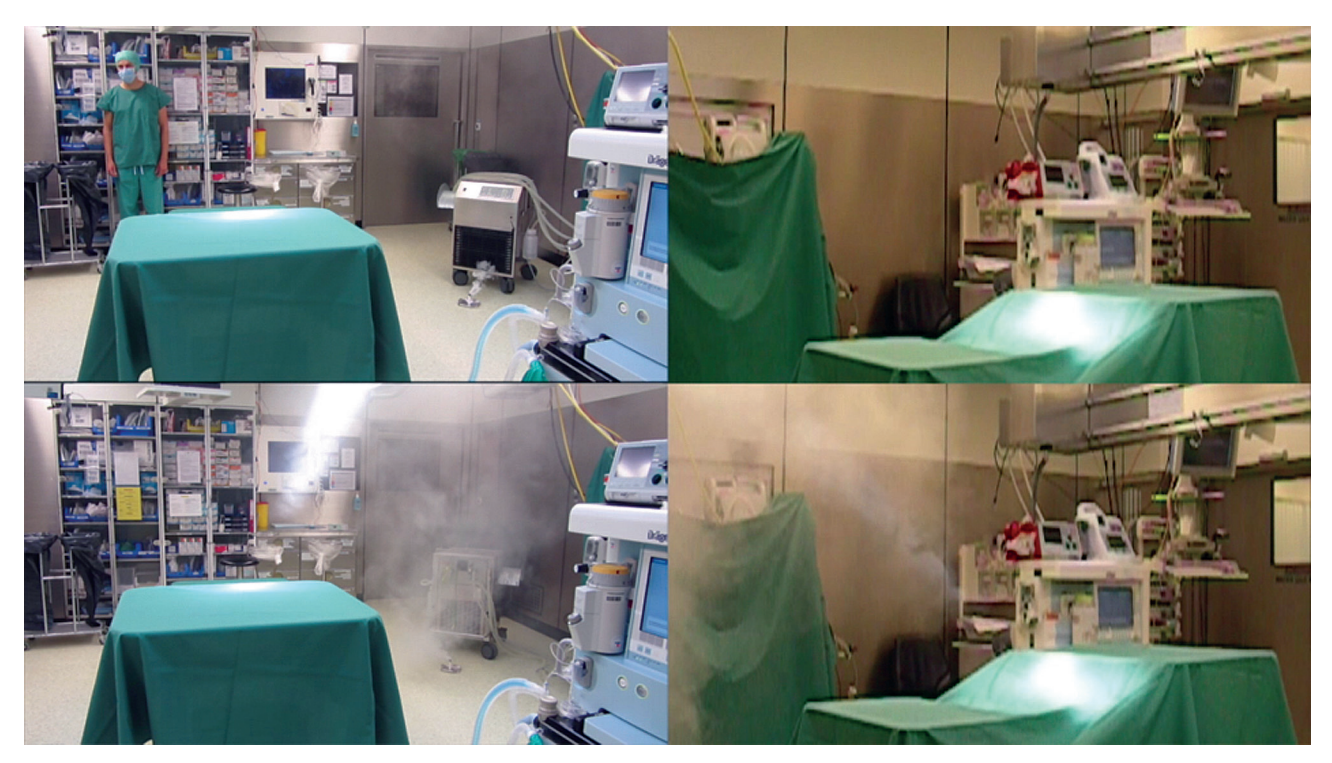
Figure 2. Video image captures showing effect of heater—cooler unit orientation on smoke dispersal in a cardiac surgery room and transmission of Mycobacterium chimaera during cardiac surgery despite an ultraclean air ventilation system (Video, http://wwwnc.cdc. gov/EID/article/22/6/16-0045-V1.htm). The device was switched on and began to ventilate 10 s after the start of the video. Frames on the left show an overview including unit placement. Frames on the right provide a lateral view of the operating field under the laminar airflow. Simultaneously recorded videos in the upper 2 frames show the first scenario, in which the main ventilation exhaust was directed away from the operating field. Simultaneously recorded videos in the lower 2 frames show the second scenario, in which the main ventilation exhaust was directed toward the operating field.

With the heater—cooler unit operating for the full 4 hours during which the plates were left open, the plate 3 m from the heater—cooler unit grew 2 CFUs of M. chimaera and the plate 5 m from the heater—cooler unit grew 1 CFU. The plate 4 m from the unit and all plates in the control test office without a unit remained sterile.