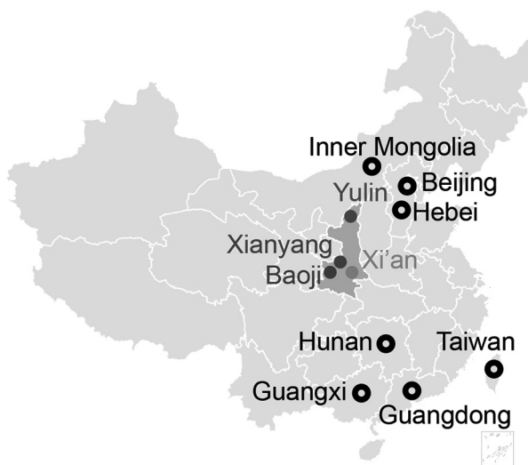
Figure 2. Geographic distribution of the avian influenza A(H7N9) viruses isolated in Shaanxi Province, China, 2016–2017 (solid circles), and of HPAI H7N9 viruses detected in other provinces of China (open circles).

Phylogenetic analyses of HA and NA gene segments reveal that the viruses obtained from human cases in Yulin and Baoji were genetically similar to those from environmental samples collected from local farms or LPMS in Yulin and Baoji (online Technical Appendix Figure 1, panel A; online Technical Appendix Figure 2), suggesting that the human H7N9 infections are related to viruses circulating in local farms or LPMS. This hypothesis is also supported by most internal gene segments, except for the NS segments of viruses from Yulin (no internal gene segments were obtained for isolate A/Environment/Shaanxi/BJ2/2017 sampled in Baoji). Most of the gene segments of the viruses from human cases in Baoji and Xianyang were similar to those of A/Environment/Shaanxi/XA4/2017, the virus isolated from LPMS in Xi'an (with the exception of PB1 from the human case in Baoji and PB2, PB1, and matrix of the viruses from human cases in Xianyang). The NS and polymerase acidic segments of the LPAI virus from a human case in Xi'an (A/Shaanxi/XA1/2017) were genetically similar to the HPAI viruses we isolated; other gene segments were close to LPAI viruses from Anhui Province in southern China.