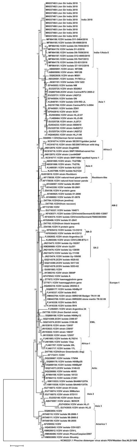
Appendix Figure 2. Phylogenetic analysis of the H gene from canine distemper virus from samples collected from Asiatic lions, Gir National Forest, India, 2018. A maximum-likelihood method along with Tamura 3 parameter + gamma model was used to generate the 688 bp tree. Scale bar represents nucleotide substitutions per site.