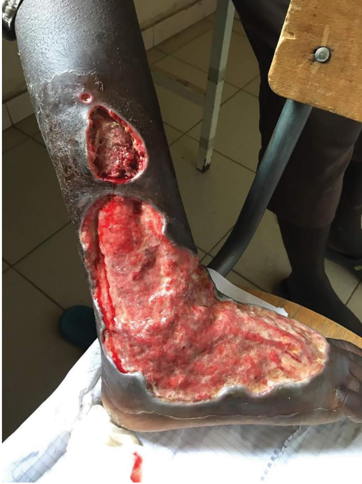
Appendix Figure 1. Leg infected with Mycobacterium ulcerans (Buruli ulcer) with undermining edges.