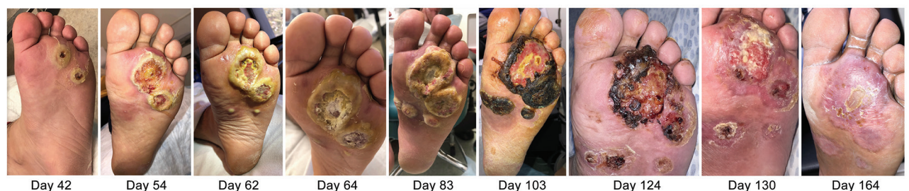
Day 42Day 54Day 62Day 64Day 83Day 103Day 124Day 130Day 164Figure 2. Visual timeline of facial lesions (top) and left plantar lesions (bottom) of immunocompromised patient with mpox, California,<br/>USA, 2022. Treatment received is indicated between images. IV, intravenous.Day 103Day 124Day 130Day 164