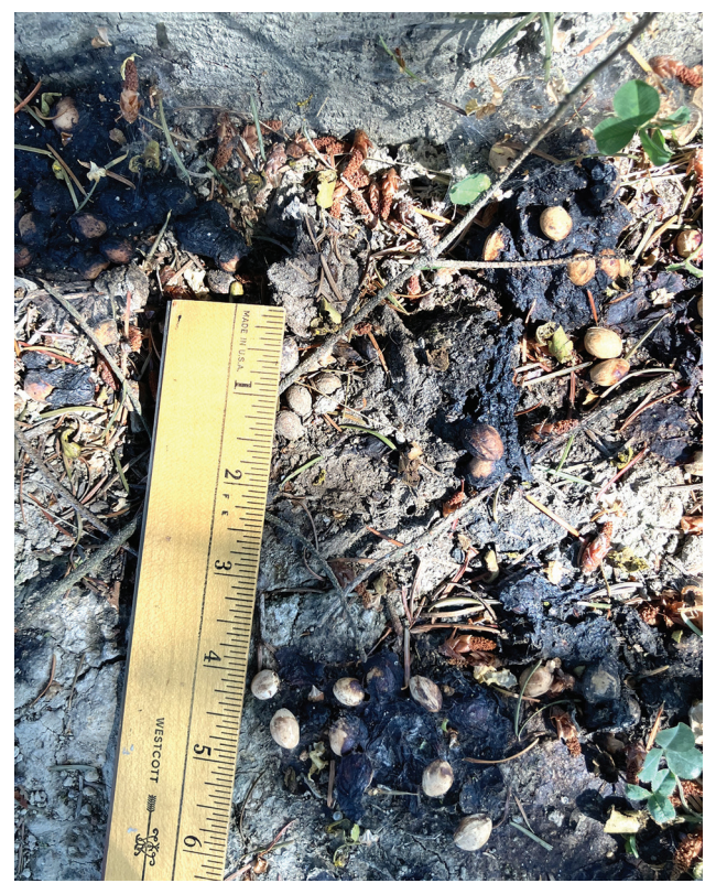
Figure 2. Raccoon latrine found at residence of child with autism spectrum disorder infected with Baylisascaris procyonis roundworms, Washington, USA, 2022.