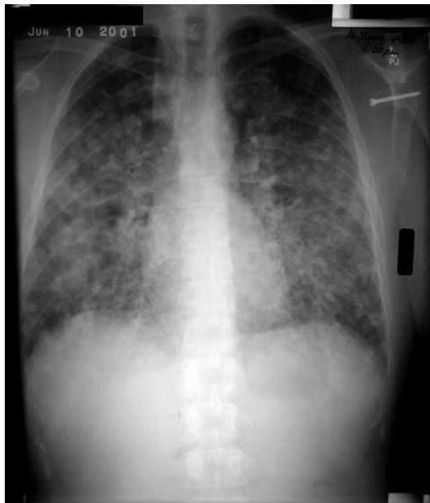
Figure. Chest radiograph of patient who acquired acute pulmonary histoplasmosis after visiting a cave in Nicaragua.

H. capsulatum exists throughout the world (1,6); however, nonimmune travelers from areas with a low prevalence of histoplasmosis, who engage in high-risk activities in disease-endemic areas, are at greater risk of acquiring symptomatic fungal infection. The number of outbreaks of histoplasmosis, especially among U.S. travelers to Latin America, has increased. Histoplasmosis has been reported in groups of travelers who entered caves with bats in Costa Rica (7; unpub. data, Centers for Disease Control and Prevention (CDC), Ecuador (8), and Peru (9). In 2001,